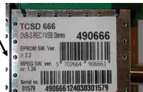
MPEG Software ID