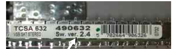
Analogue modules software ID